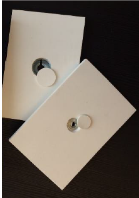
Weldable tile showing steel insert and cap

We also custom manufacture custom sizes and thicknesses of weldable tile to suit a variety of applications. Please contact us for your requirements or questions at 780-435-1921 or salesedm@moffattsupply.com .